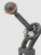
Multi Direct Base II Long