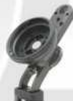
D Holder Extension Bar with Lens Holder